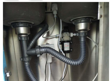
- Water Sink Kits -