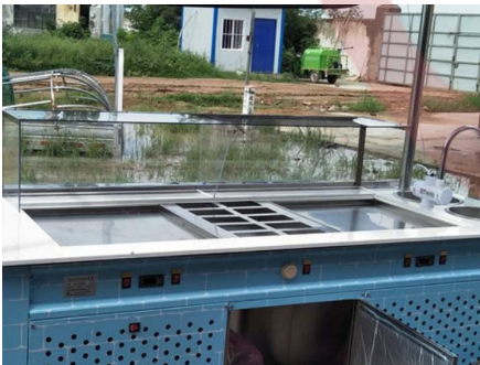
- Rolled Ice Cream Machines -