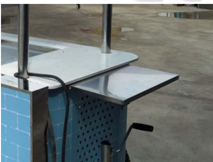
- Stainless Steel Shelf -