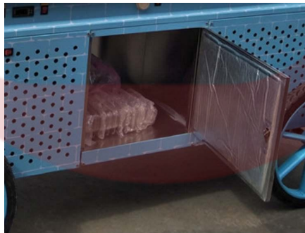
- Storage Cabinet -