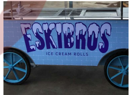
- Vinyl Graphic -