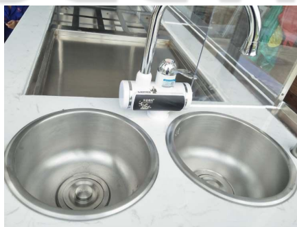
- Water Sinks -